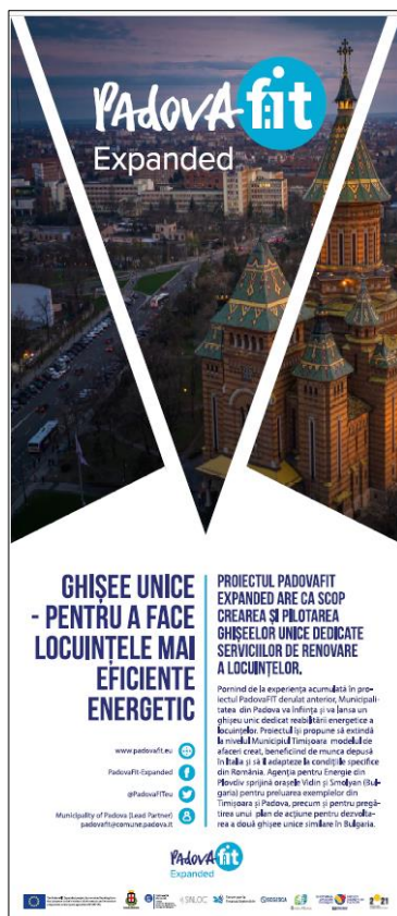
Roll-up: Romanian version with background layout from Timisoara.