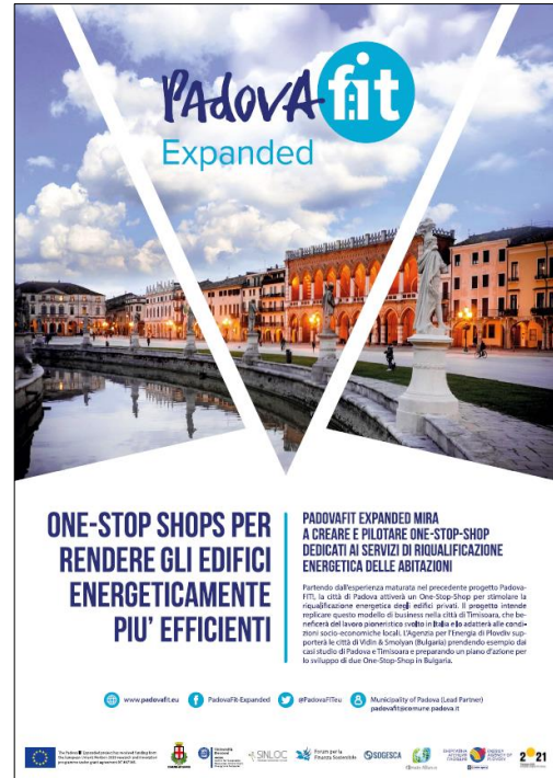
Poster: Italian version with background layout from the City of Padova.