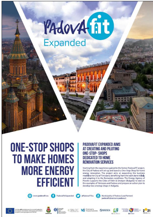
Poster: Version combining elements from all pilots.